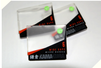
仅供参考样品 Sample for reference

气动密封式油墨八色移印机 Pneumatic shuttle around 8-color printing machine